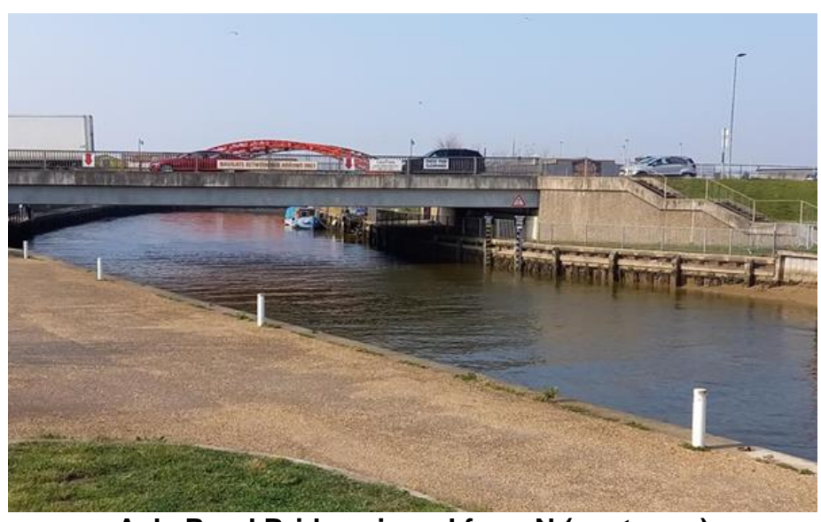
Acle Road Bridge viewed from N (upstream)