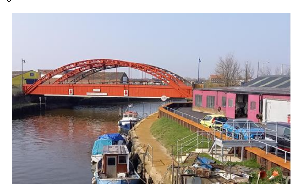
Vauxhall Bridge viewed from N (upstream)

The closest leisure craft facilities to the port (Great Yarmouth Yacht Station) are on the River Bure and are operated by the Broads Authority. In order to access, mariners will need to navigate under two additional fixed bridges with air draught clearances similar to Haven Bridge (4.3m at Chart Datum). Air draught boards are available.