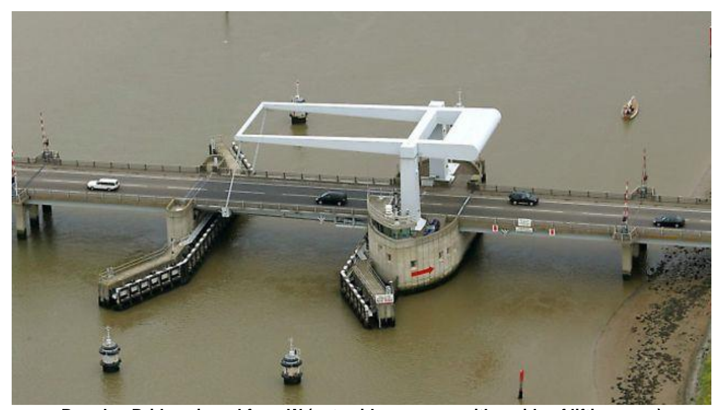
Breydon Bridge viewed from W (note side-spans on either side of lifting span)

Breydon Bridge is a single-leaf bascule bridge which opened in 1985. The span between the abutments of the lifting section is 23m, and when in the closed position the maximum air draught is 5.9m at Chart Datum (lifting section only).