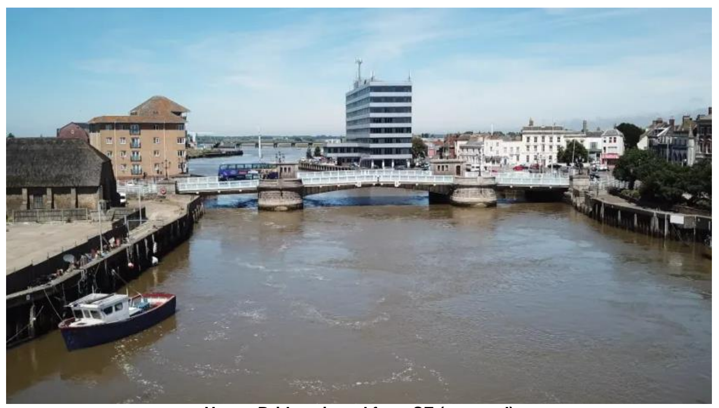
Haven Bridge viewed from SE (seaward)

Haven Bridge is a double-leaf bascule bridge which opened in 1930. The span between the abutments is 26.8m. The span between the leaves at full open position is 24m (minimum span at height 18.3m above Chart Datum).