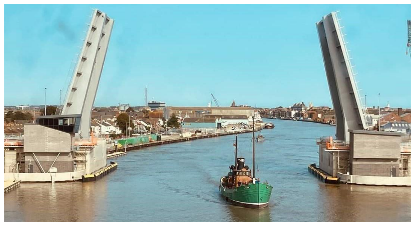
Herring Bridge viewed from S (seaward)

Herring Bridge is a double-leaf bascule bridge which opened in 2023. The span between the abutments of the lifting section is 50m, and when in the closed position the maximum air draught is 6.9m at Chart Datum. Herring Bridge is owned by Norfolk County Council.