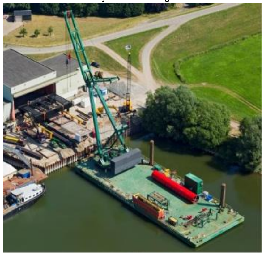
Skylift Crane Barge

Notice is hereby given that bore hole drilling operations will be taking place in Sheerness Harbour. The drilling works are due to commence on or around 17<sup>th</sup> April 2024 with completion expected within 2 – 3 weeks. Work will be conducted from the "Skylift 2" crane barge which will be accompanied by the tug "Pullmor" and safety boat WSB RECOVERY and/or WSB RESPOND. Whilst on site, the works will team will maintain a listening watch on VHF Channel 74 at all times.